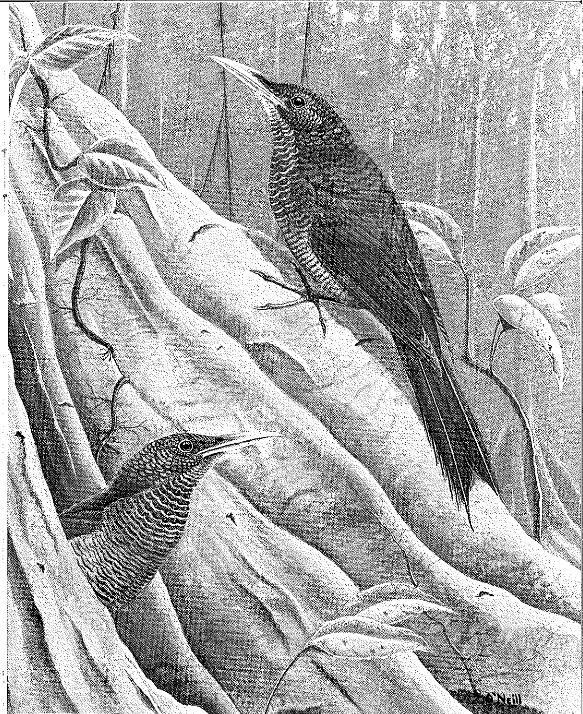
BARRED WOODCREEPER, Dendrocolaptes certhia sheffleri

A NEW SUBSPECIES FROM THE MEXICAN STATE OF OAXACA